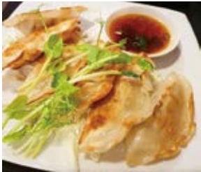
Gyoza (S) (L) (Steam/pan fried) $6.4 $12.8