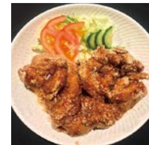
Spicy Karaage Don $18.5