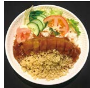
Miso Pork Belly Don $18.5