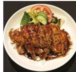
Teriyaki Chicken Don $18.5