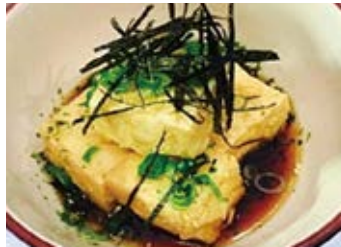
Agedashi Tofu $8.5