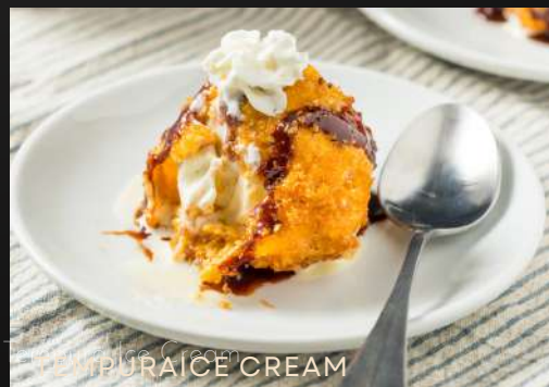
TEMPURA ICE CREAM