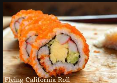
Flying California Roll