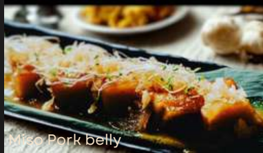
Miso Pork belly